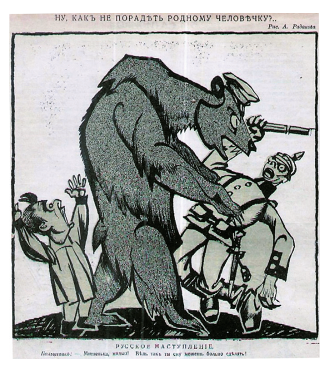
Fig. 9. Radakov, Aleksandr. "Nu, kak ne poradet' rodnomu chelovechku?". Novyi satirikon 26 (1917): 12

was hardly accidental. Orlando Figes and Boris Kolonitski, analyzing how contenders for power fought for the right to control the symbolic system of the revolution, suggest a distinction between "language of inclusion" and "language of exclusion" in Russia in 1917 [31, p. 116]. The former is characteristic of populist discourse, the latter of Bolshevik discourse, and the bear was an element of the former. Another important change was gradual closure of satirical journals that were close to "counterrevolutionary" parties. According to the authors of one book published in the Soviet era, "taking advantage of the freedom of press that was granted to the revolutionary people, bourgeois newspapers and magazines continued to poison minds and sow confusion in the people's consciousness, to smear the streams of lie and calumny at the working class and its party. All kinds of 'barabans,' 'trepachs,' pugachs,' and the like stinking offspring of Novyj satirikon and Bich turned into openly libeling editions. <...> by the end of August of 1918 every possibility of renewal of this press in the country was totally eliminated" [32]<sup>22</sup>.