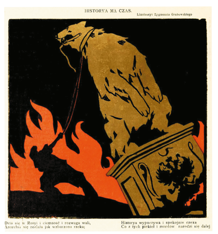
Fig. 5. Grabowski, Zygmunt. "Historya ma czas", Sowizdrzał , September 30, 1917

in the background, next to a spreading fire (fig. 5). The (Bolshevik's?) loop is just going to overthrow the stone pedestal and the bear (also made of stone?) standing on it. The giant beast bares its teeth, which are holding the knout, but otherwise remains motionless. The inscription below the illustration says: