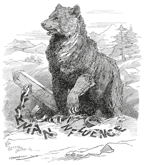
THE BREAKING OF THE FETTERS.

Interestingly, British caricatures presented mirror images in comparison to the German cartoons. For instance, the cartoonist from Fliegende Blätter presented a bear which after the revolution recognised his true interests and chased the British lion away<sup>13</sup>, and a cartoonist from Punch presented a bear that broke the fetters of German influence and got back on the right path (which we can assume was a strict alliance with the Entente (fig. 3).