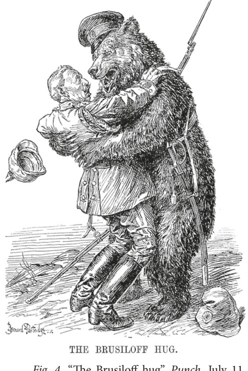
Fig. 4. "The Brusiloff hug", Punch, July 11, 1917

We can also trace a motif of hostility between the Russian bear and the Bolsheviks in the English satirical press, which was intended to illustrate the anti-Russian character of the communist regime. However, in this narrative the satirists of Punch preferred to use an another symbol of Russianness than a bear. The tragic fate of this country was usually shown with a metaphor of wicked, brutal Bolshevik robbers and of a beautiful, defenseless Mother Russia [IV; see also: 26, p.93].