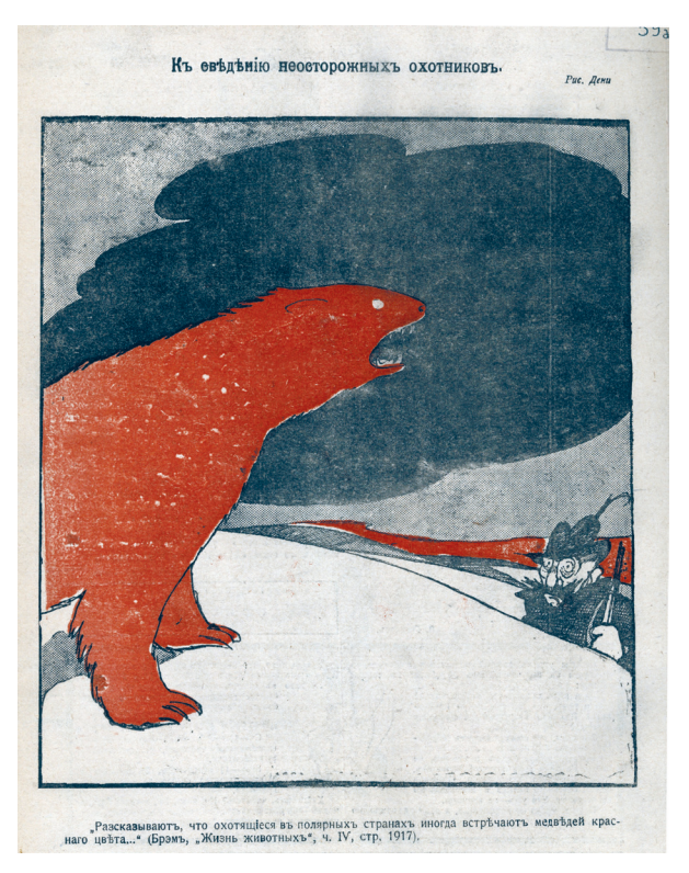
Fig. 8. Deni. "K svedeniiu neostorozhnykh okhotnikov." Bich 6 (1917): 16

perception of the bear as Russia's allegory — the image was now used to demonstrate her impotence. The comic effect was achieved by contrasting the bear's size with its weakness and inability to stand up to the German eagle [for instance: XVIII, p. 16].